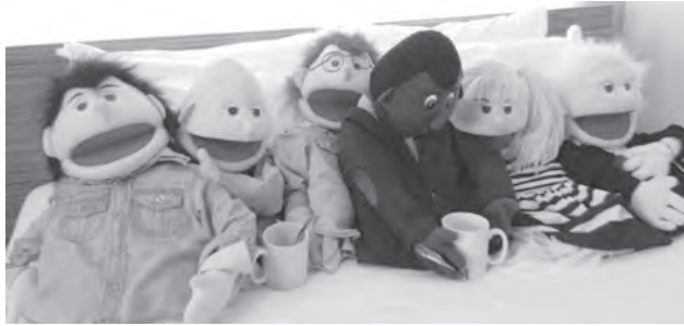
Puppets bring joy, laughter, smiles and connection.