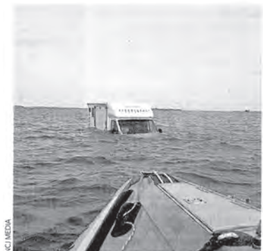
Out to sea The RNLi rescued two people whose van was cut off by the tide on Holy Island causeway, Northumberland.